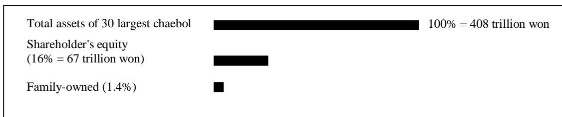
Fig. 3.1: Chaebol's average equity shareholding