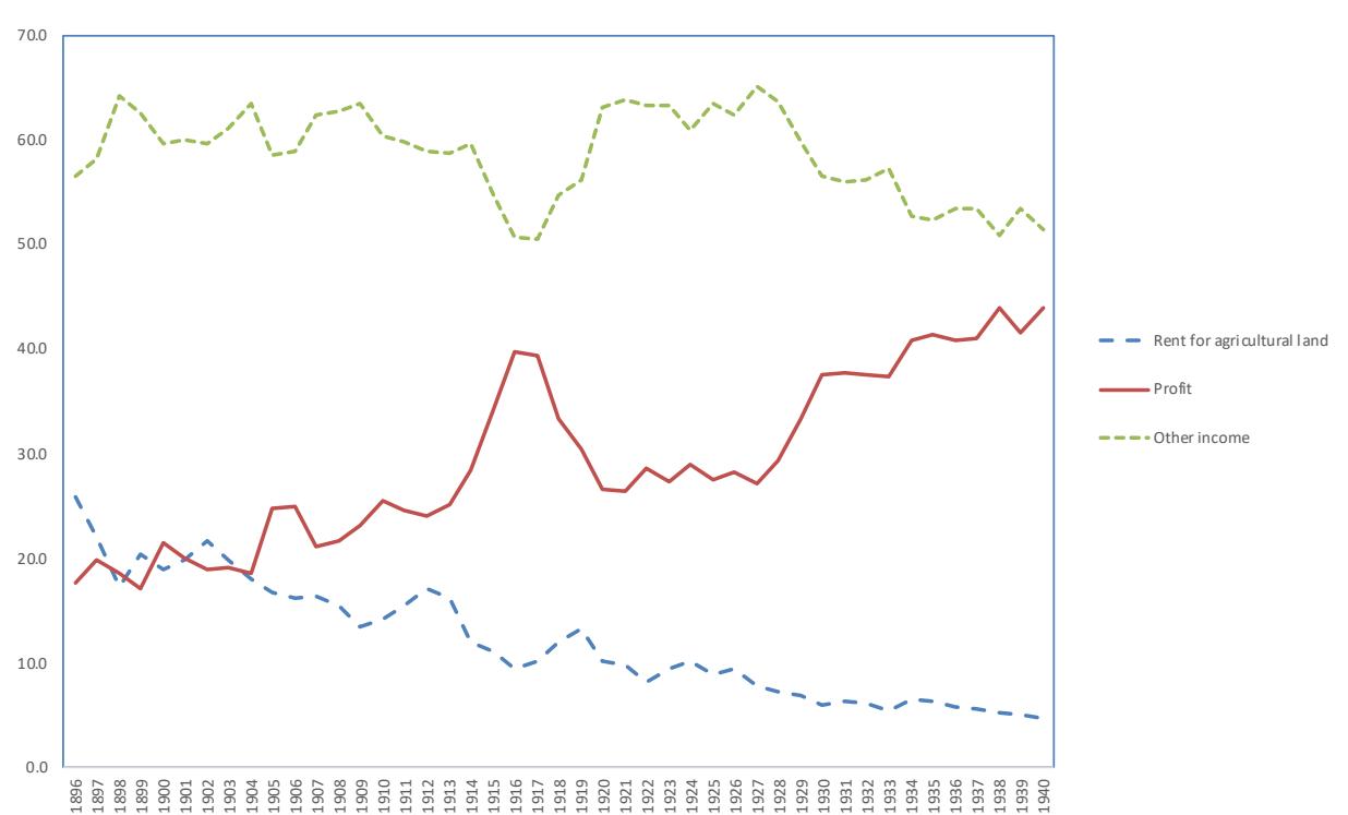
Figure 3: Functional income distribution

Source: Umemura et al. (1966), pp.146-147, pp.152-153; Shinohara (1972), pp. 140-147.